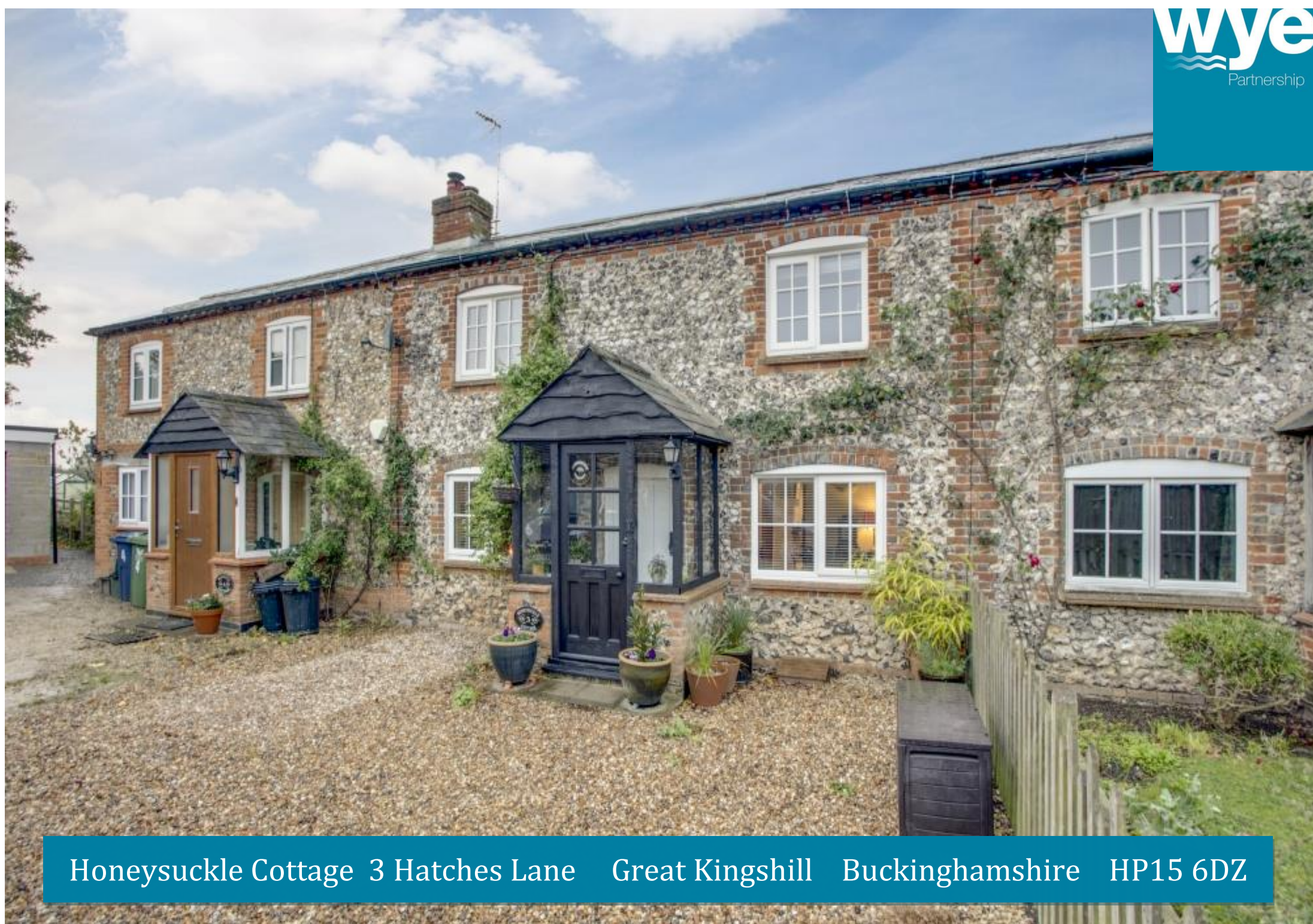
Honeysuckle Cottage 3 Hatches Lane Great Kingshill Buckinghamshire HP15 6DZ